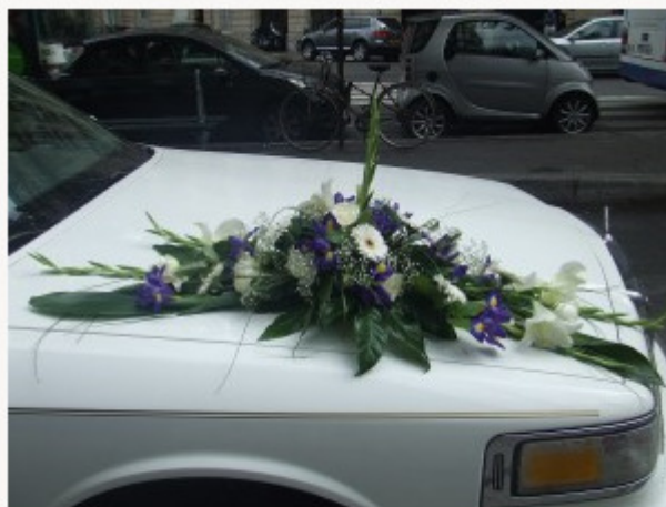
Create your own wedding centerpieces